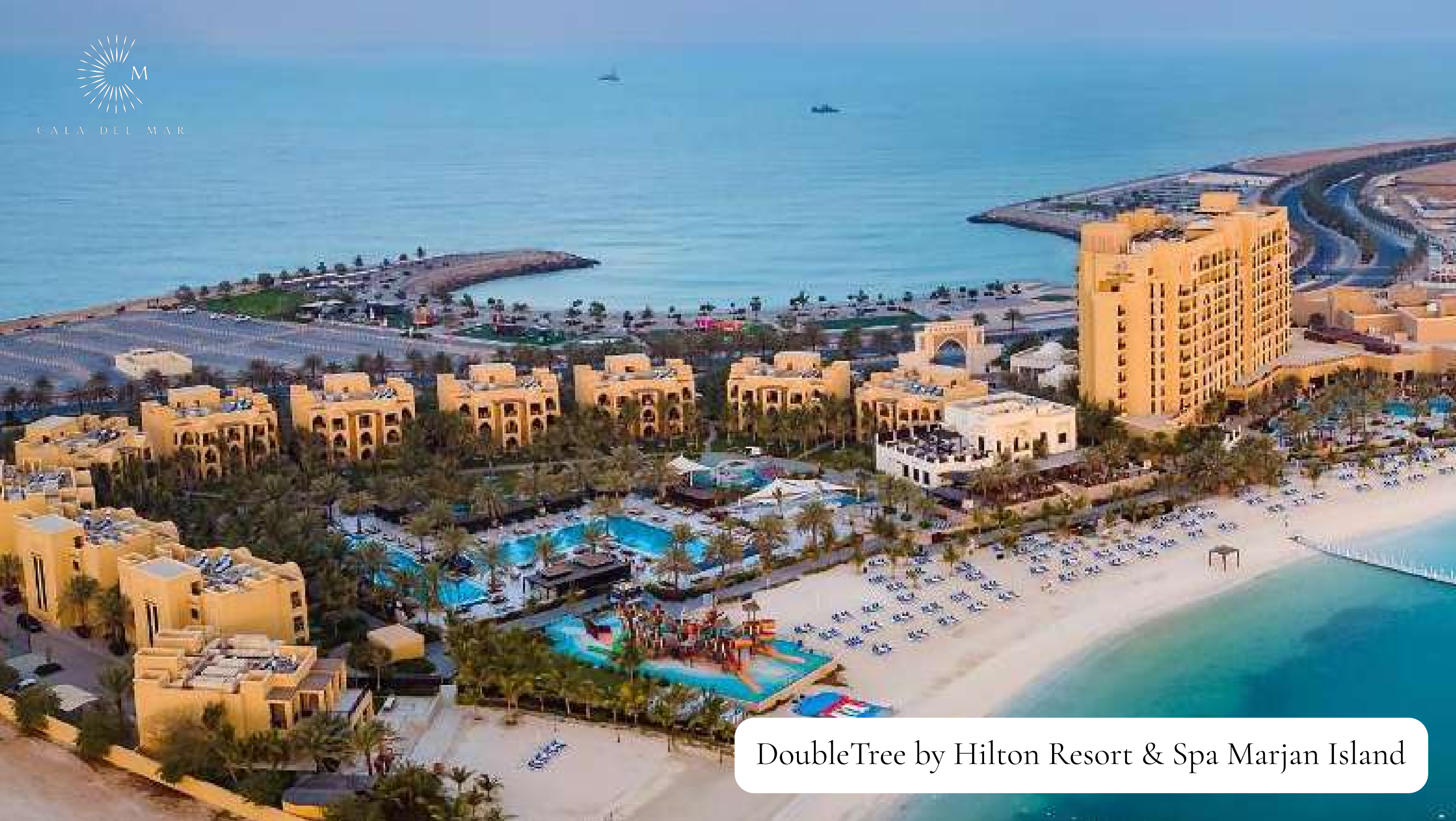
DoubleTree by Hilton Resort & Spa Marjan Island